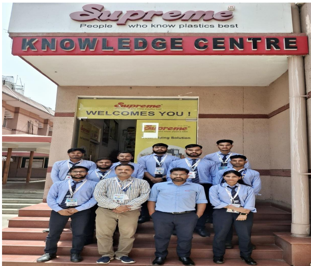
Visit to Supreme Industries on 21/05/2025