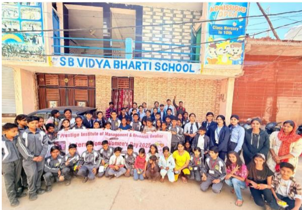
Good touch bad touch session under “Power of her” organised from 01/03/25 to 08/03/2025