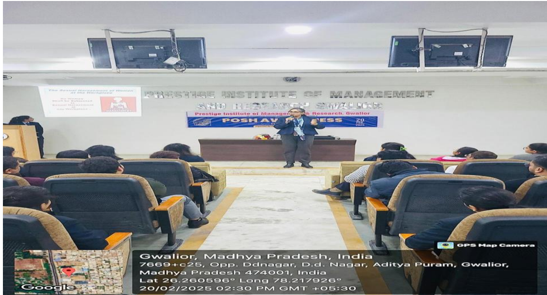
Glimpse of POSH workshop conducted on 20/02/2025