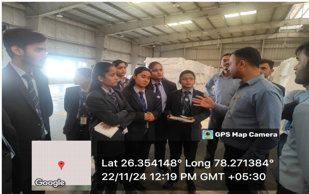
Visit to Kurlon Industries on 22/11/2024