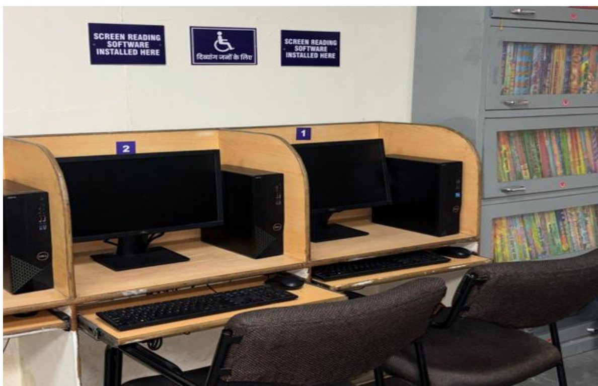
Screen Reading Software and Reserved seats for Divyanjans.