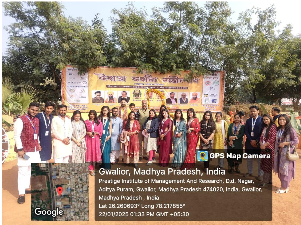
Glimpse of Deshaj Darshan Mahotsav held on 22/01/2025 and 23/01/2025

Institute of Management and Research (PIMR), Gwalior, in association with Jiwaji University, Vikrant University, Amity University, and other academic institutions.