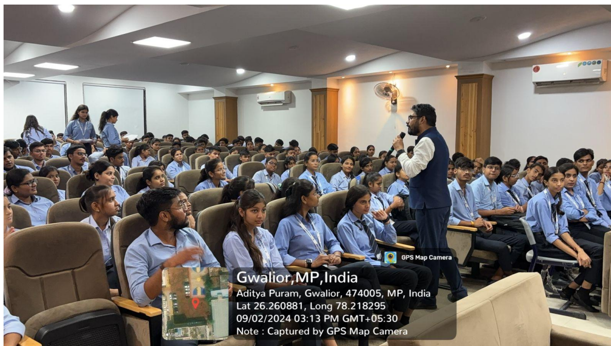
EML Session on “How to become a global leader” on 02/09/2024