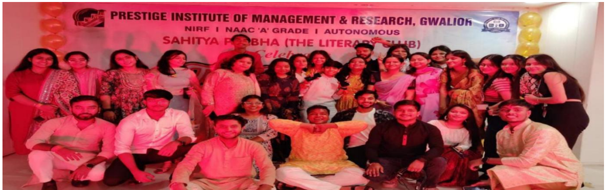
Teacher's day celebration on 5 th September, 2024