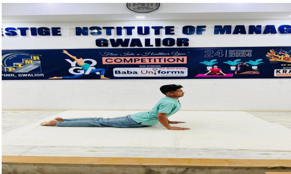
Glimpse of Yoga competition under “Spandan 2024” conducted during 23, 24 and 25 October 2024