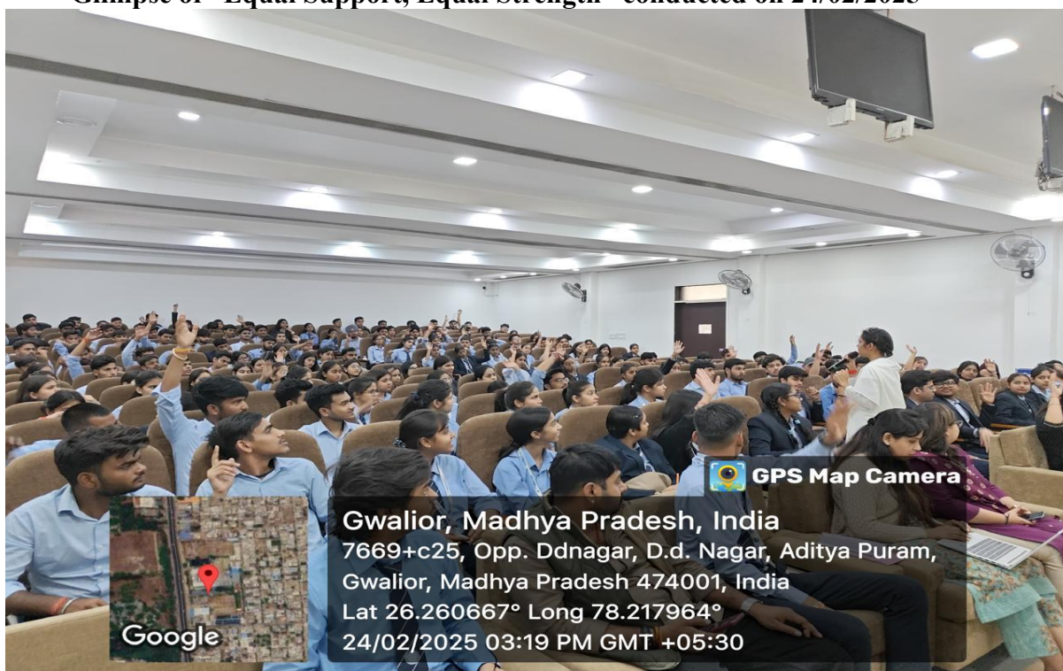
Glimpse of “Equal Support, Equal Strength” conducted on 24/02/2025