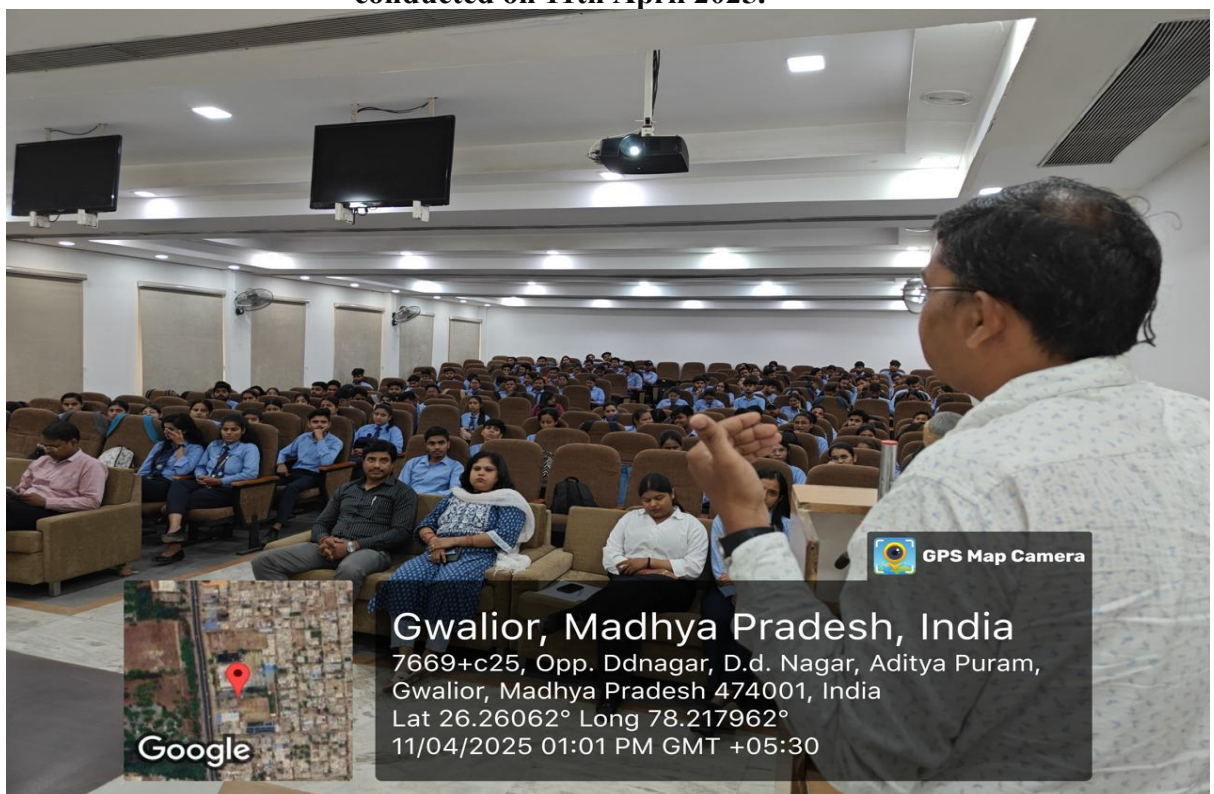
Glimpse of "Ambedkar in Campus – Champion of Social Justice & Equality" conducted on 11th April 2025.