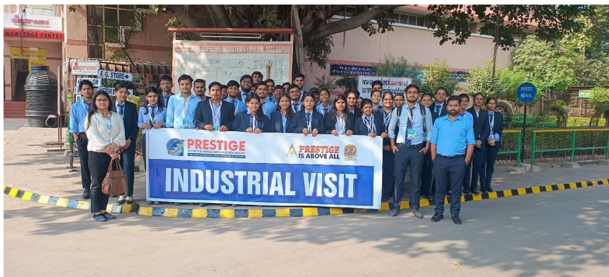
Visit to Supreme Industries on 02/12/2024