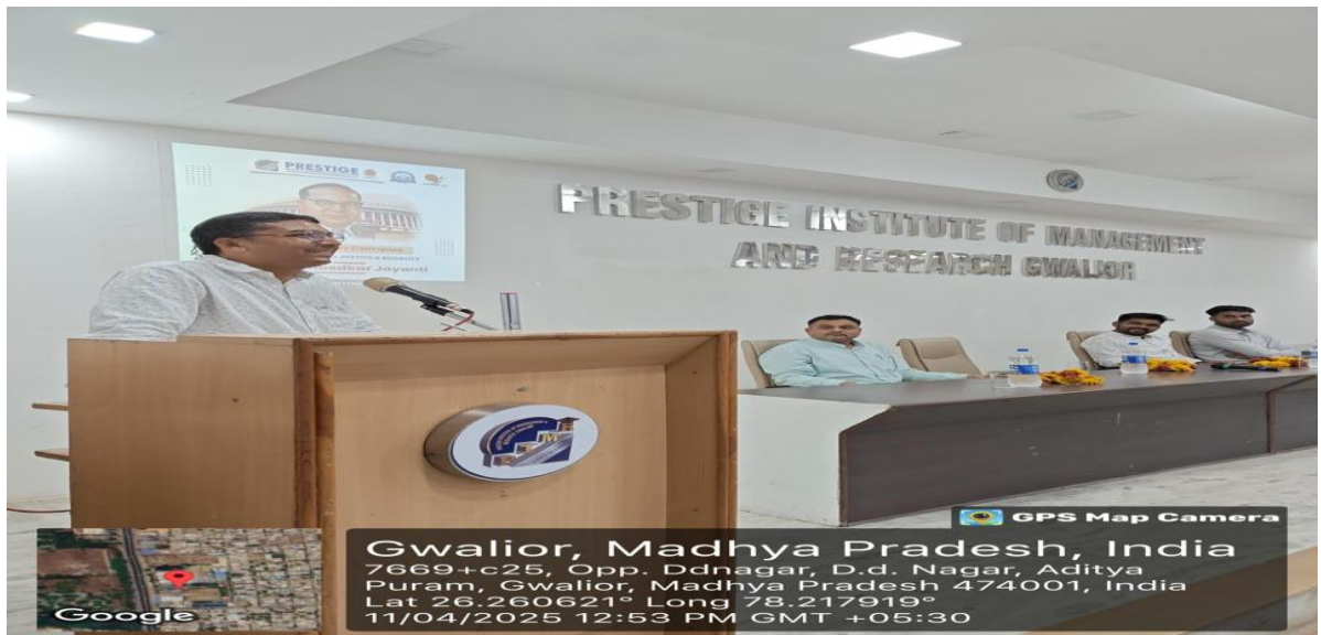
Glimpse of "Ambedkar in Campus – Champion of Social Justice & Equality" conducted on 11th April 2025.