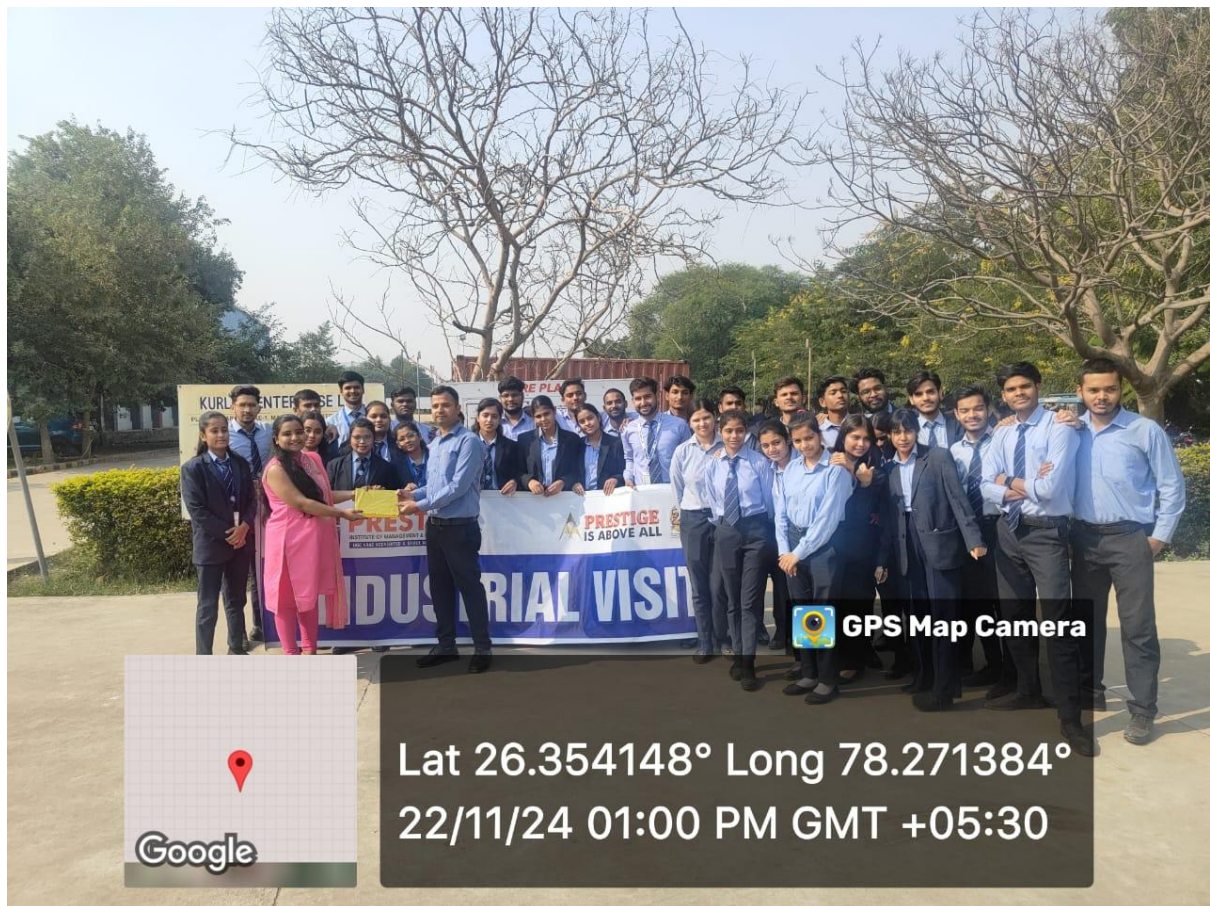
Visit to Kurlon Industries on 22/11/2024