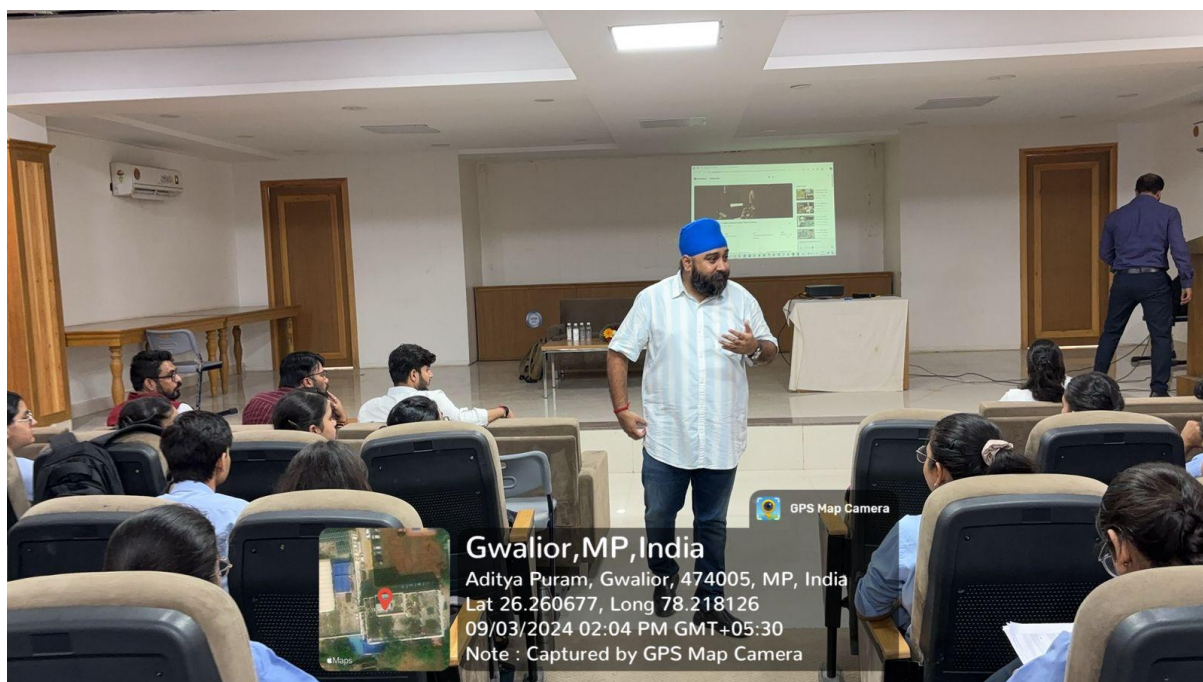
EML Session on “Traits to be successful in Next Decade” on 03/09/2024