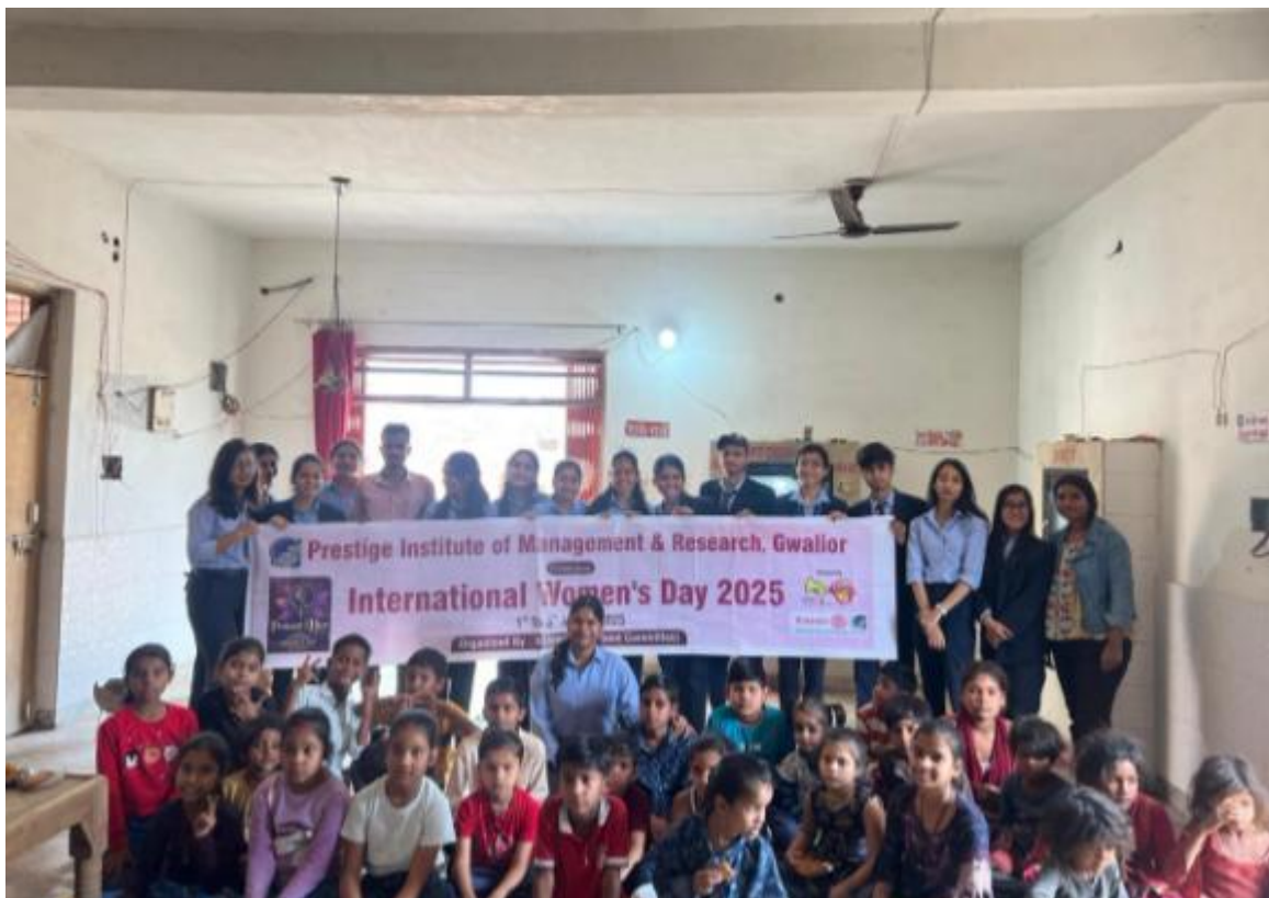
Good touch bad touch session under “Power of her” organised from 01/03/25 to 08/03/2025