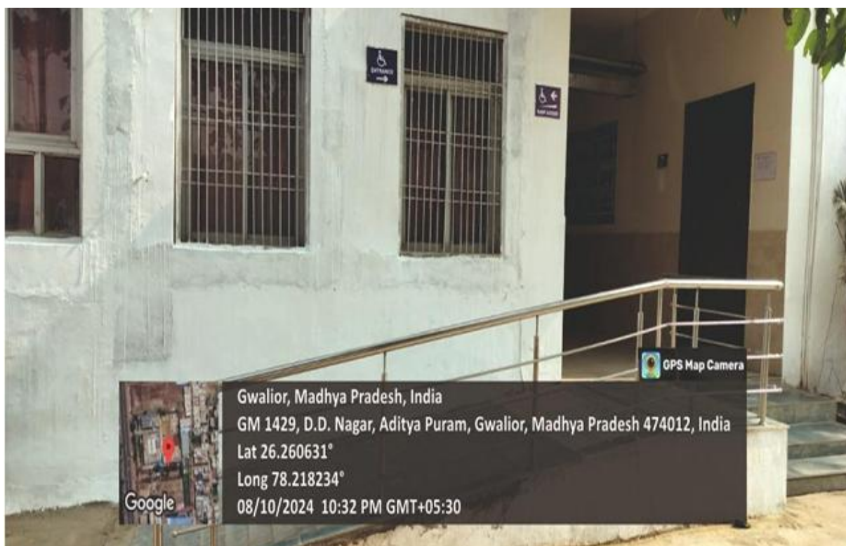
Ramp for access of Divyanjan