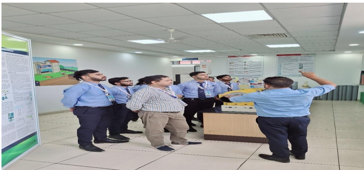
Visit to Supreme Industries on 21/05/2025