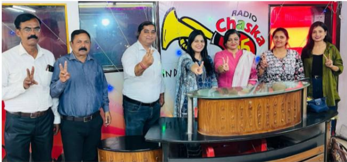
Radio talk show conducted under “Power of her” organised from 01/03/25 to 08/03/2025