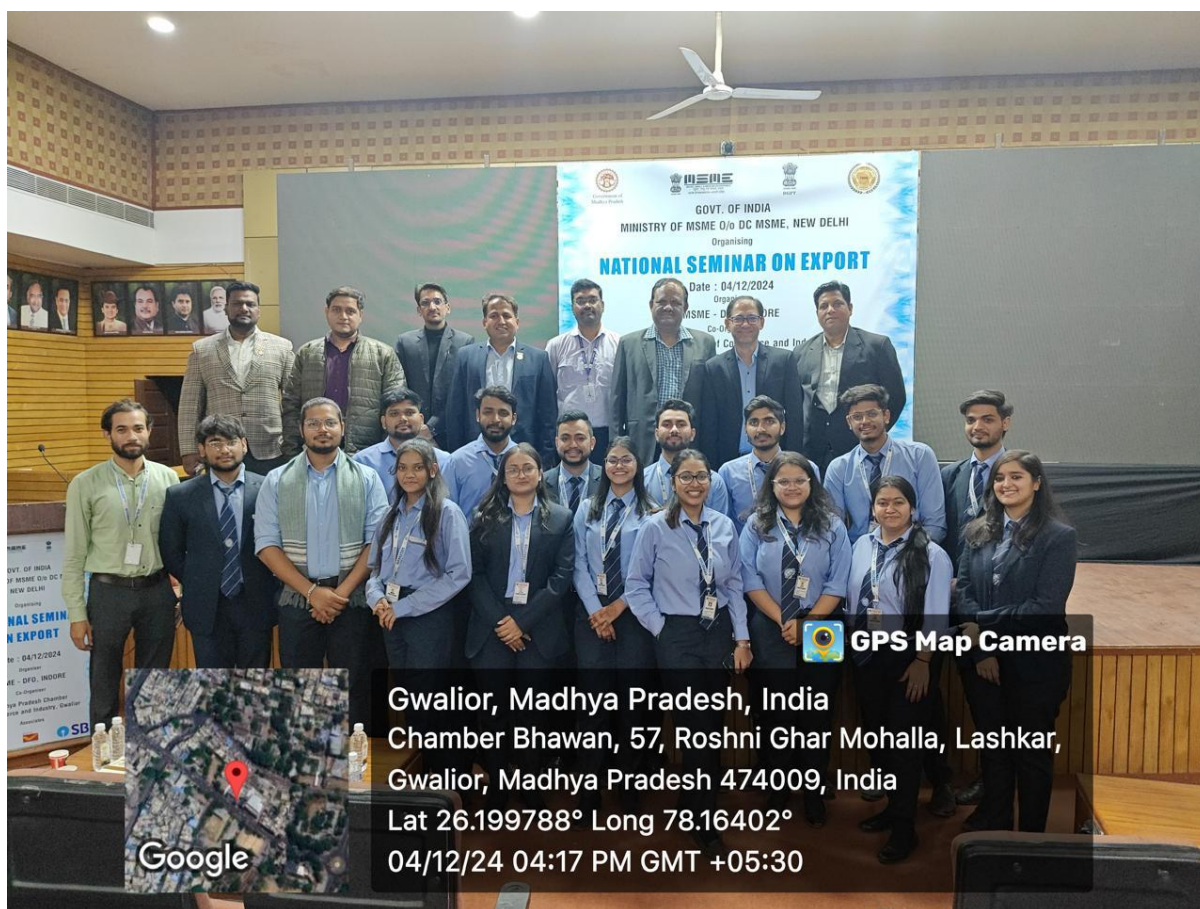
Glimpses of National seminar in Export held on 04/12/2024

Innovative teaching pedagogy plays a crucial role in fostering and enhancing skill development in learners. It's a synergistic relationship where effective teaching methods create an environment that actively engages students and empowers them to acquire and refine essential skills. They help students develop critical thinking, problem-solving, and collaboration skills. Our learned faculty embraces teaching with various teaching pedagogies according to students understanding and course. Role Plays, Business Quiz, Project Assignments, and case studies are used to enhance learning. The use of ERP and FTP by students and faculty is intensified at PIMR, Gwalior. This initiative was helpful in creating a synergistic effect, providing students with a more engaging and relevant educational experience. Smart boards in the classrooms also play an important role.