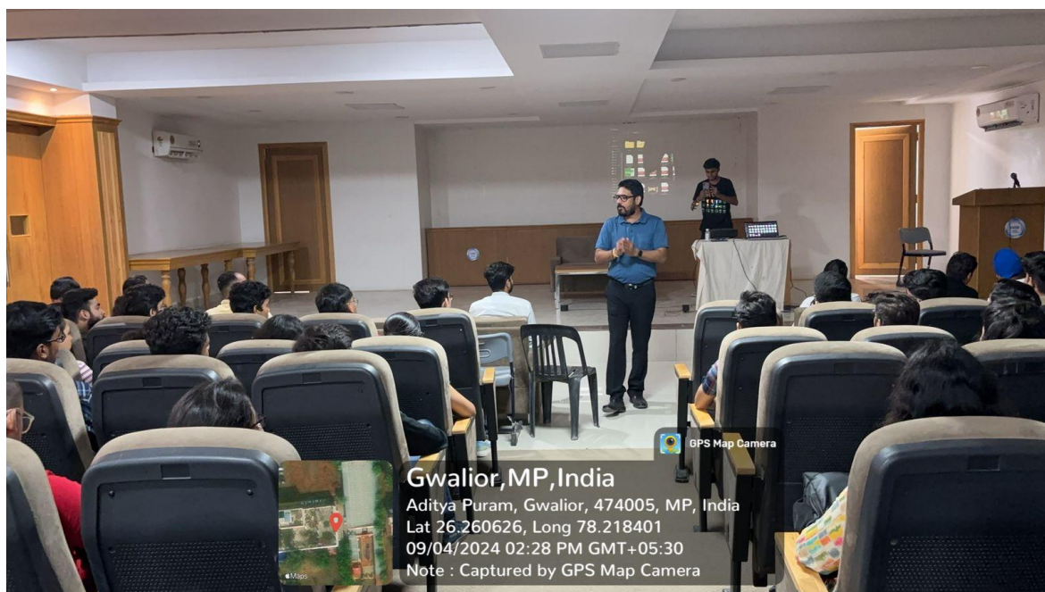
EML session on “Be Future Ready” on 04/09/2024