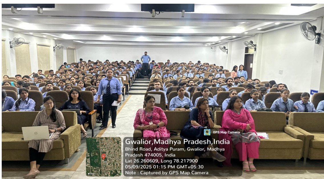
Glimpse of Gender Sensitivity workshop conducted on 09/05/2025