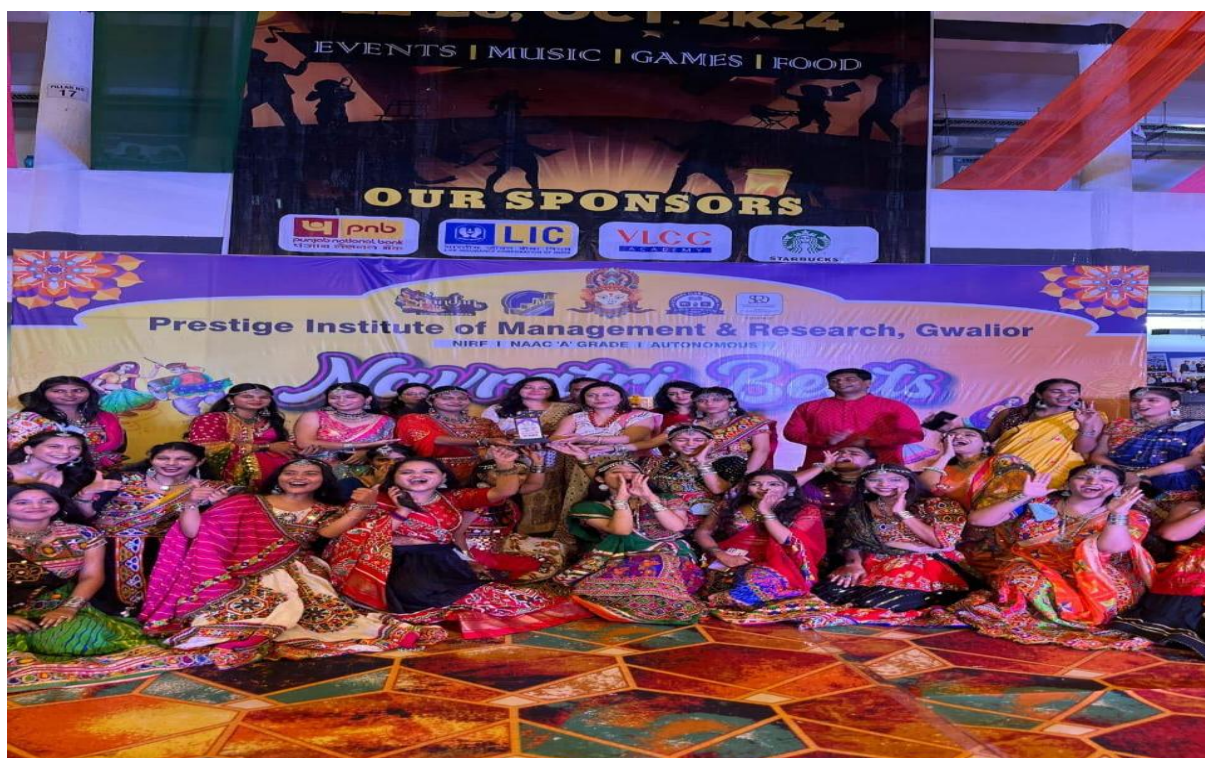
Glimpse of “Garba” conducted on 05/10/2024

These activities are focused on developing intellectuals with great confidence, team working skills and humanity. These initiatives also develop teamwork and social responsibility among students.