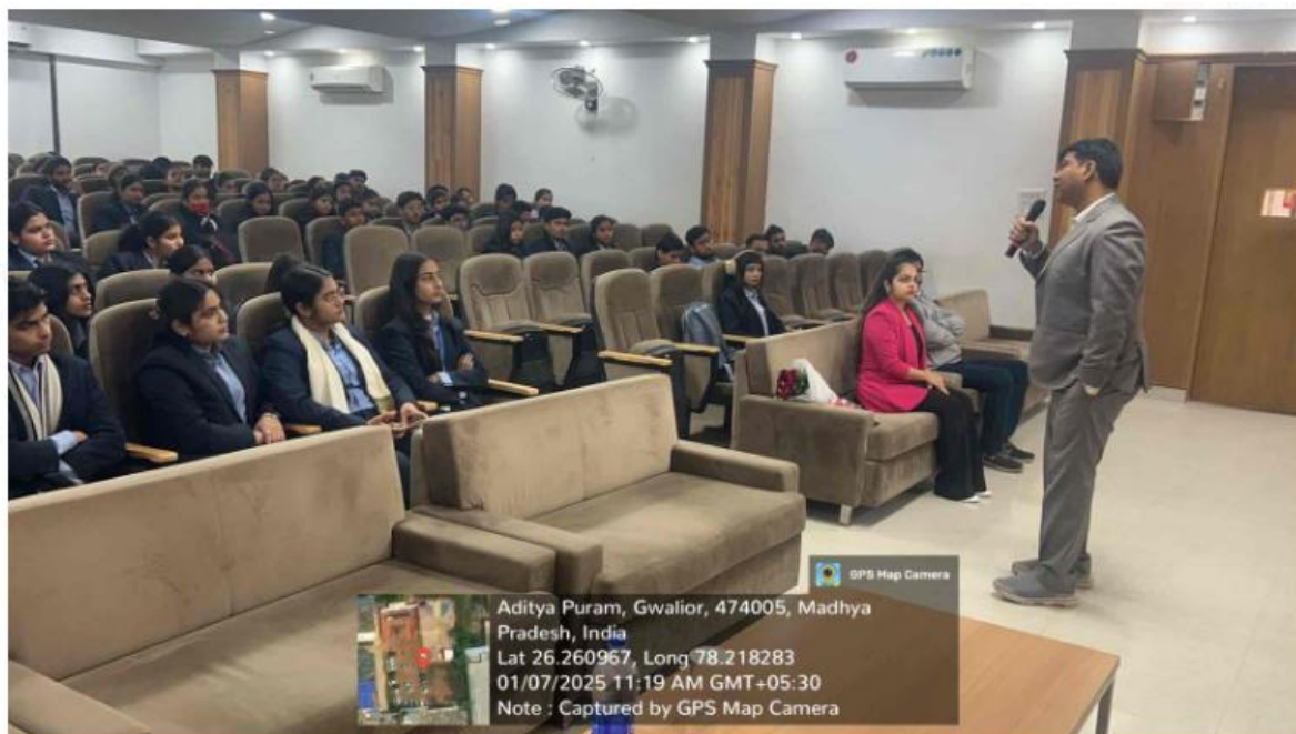
EML on A Startup Journey with Indian Financial Market on 07/01/2025