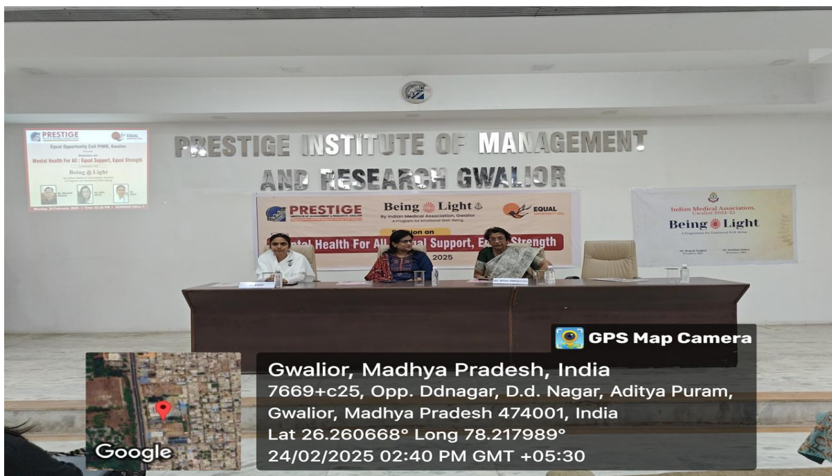
Glimpse of “Equal Support, Equal Strength” conducted on 24/02/2025