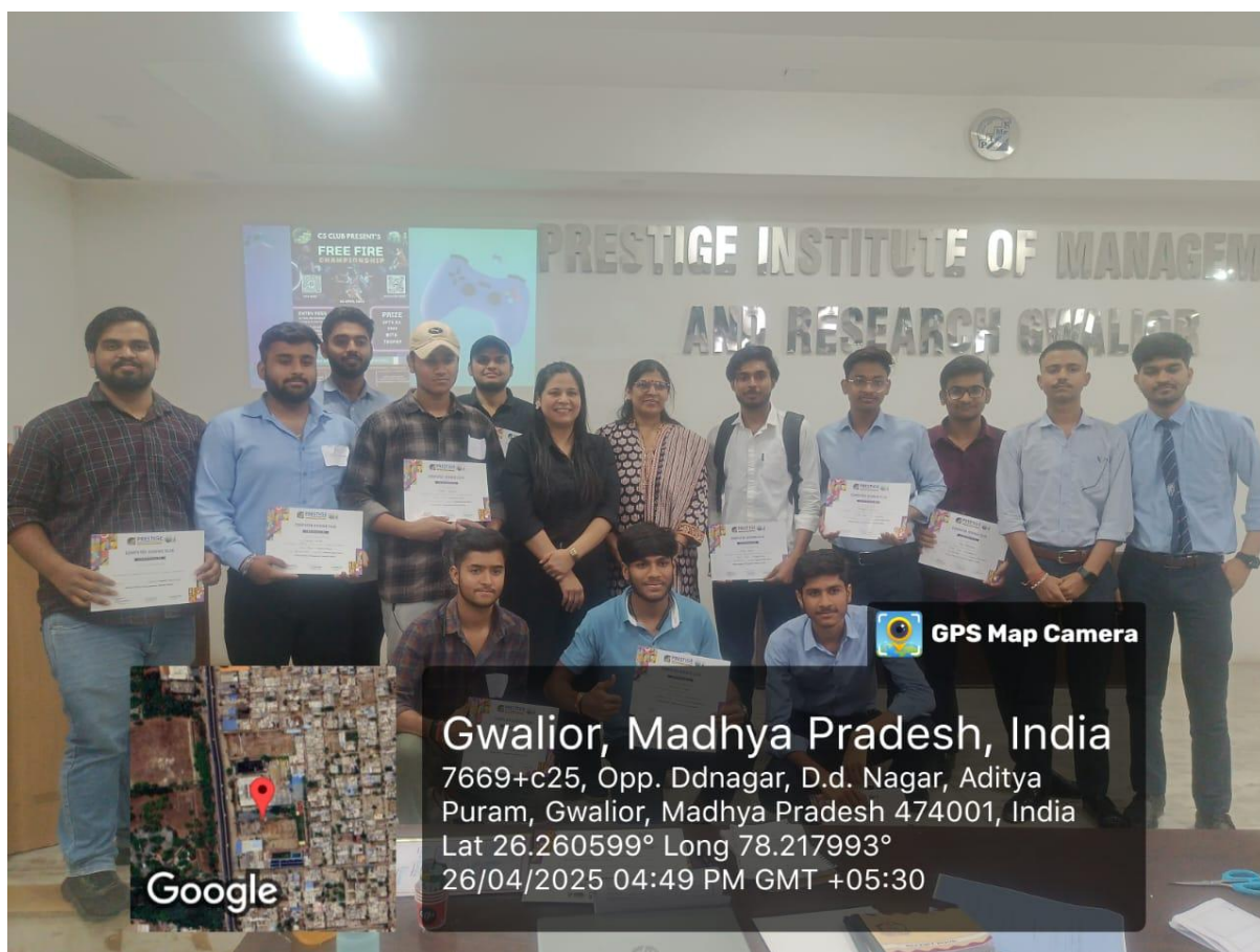
Glimpse of “Free Fire Event” conducted under CS Club on 26/04/2025