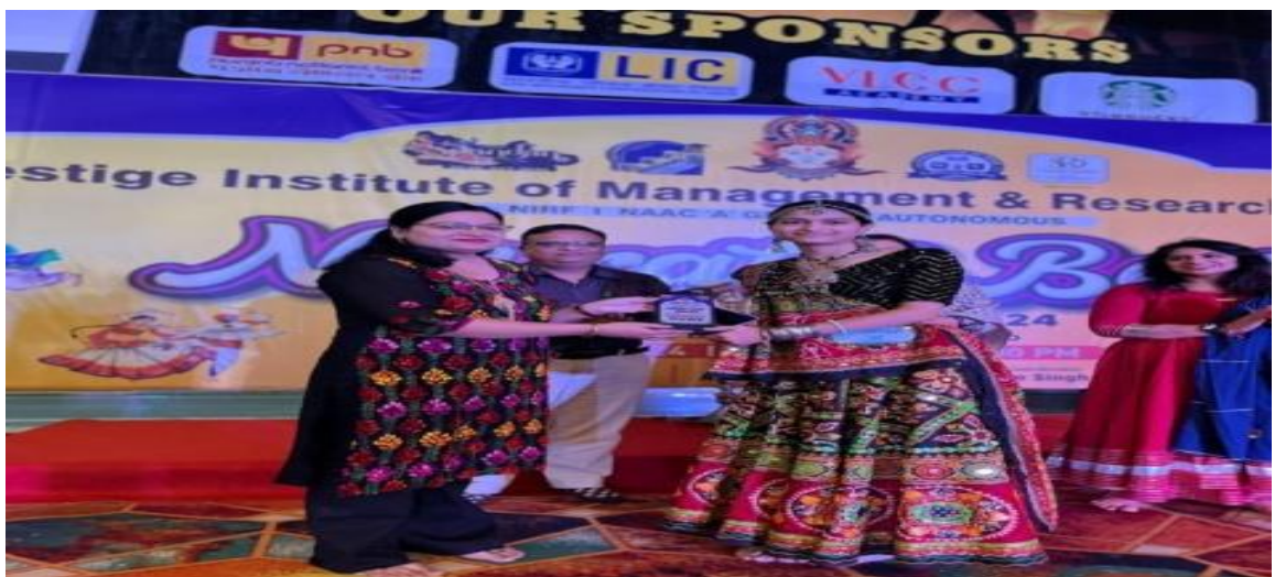
Garba celebration during Navrartri 05/10/2024