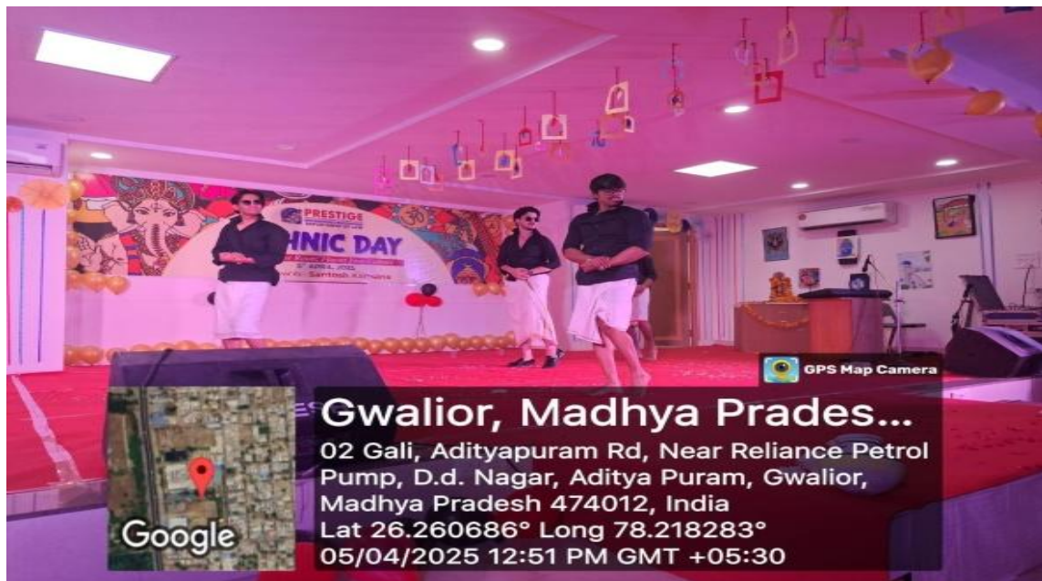
Ethnic Day 2025 –Colors of India celebrated on 5th April 2025