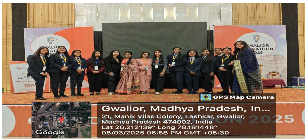
Glimpse of “Gwalior Hackathon 2025 held on 08/03/2025