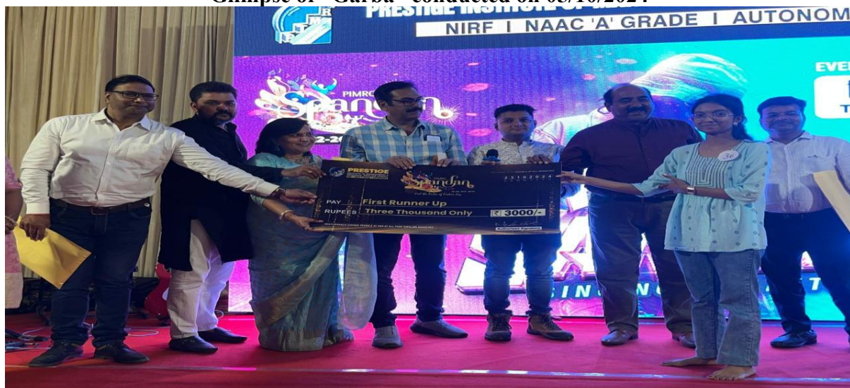
Glimpse of “Spandan 2024” conducted during 23, 24 and 25 October 2024