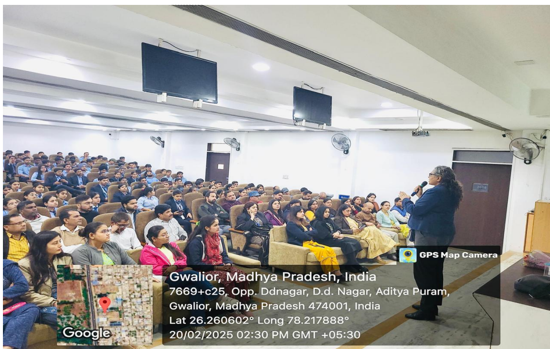
Glimpse of POSH workshop conducted on 20/02/2025