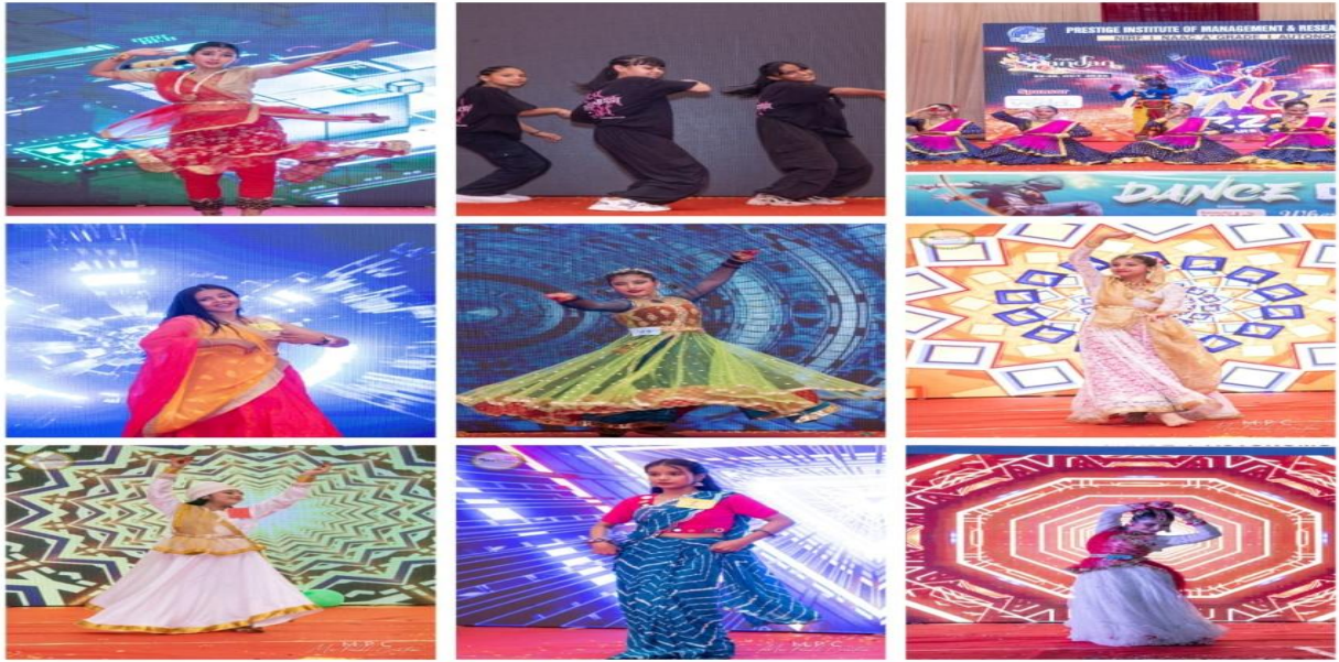
Cultural night of spandan 2024 conducted on 23-25 October 2024